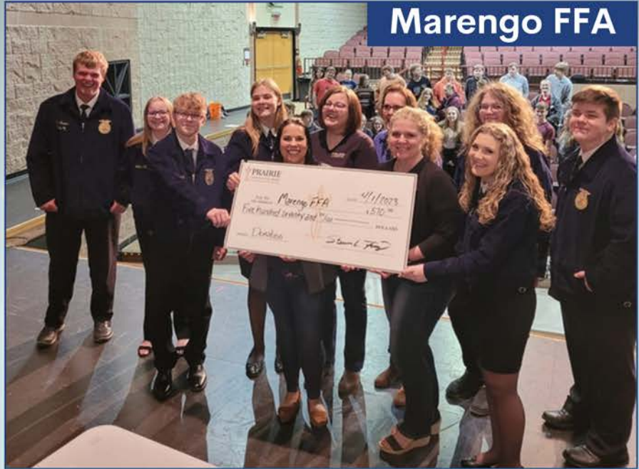
Prairie employees presented donations raised during the bank's Jeans Day event in March to members and alumni of the Marengo Community High School's Future Farmers of America (FFA).