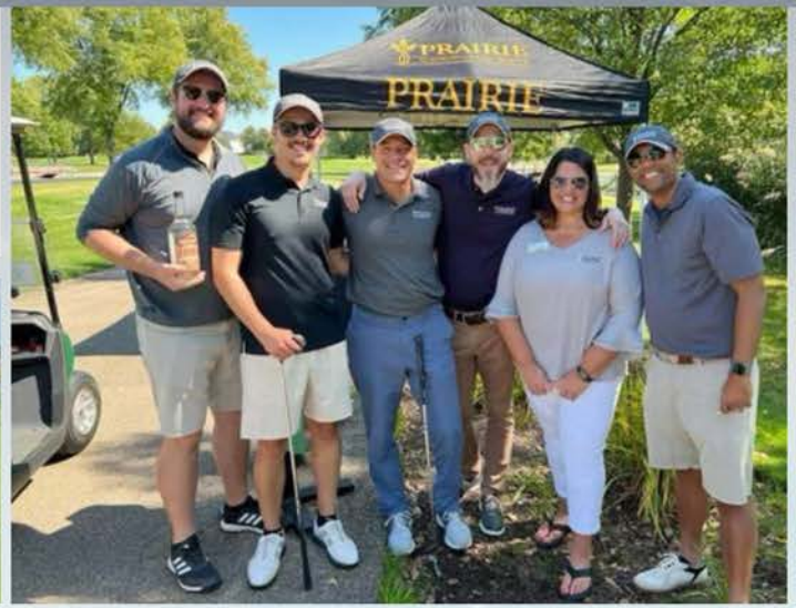
Teeing it up at golf events hosted by the Elgin, Huntley, and Marengo-Union Chambers of Commerce.