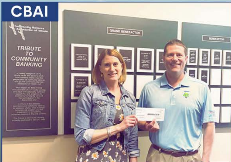
In April, Prairie's employees raised donations for the Community Bankers Association of Illinois Foundation for Community Banking, which offers scholarships to top Illinois high school seniors.