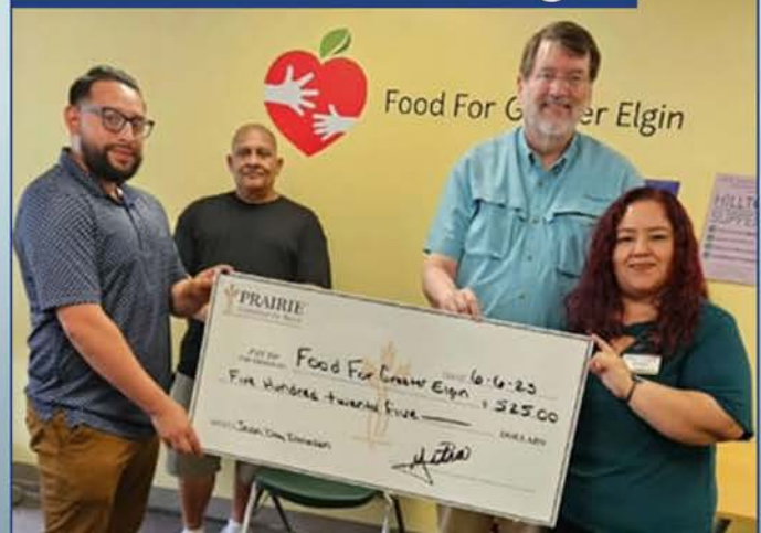
In May, Prairie raised funds to donate to Food for Greater Elgin. The organization delivers food to low income neighborhoods and senior living facilities, among others.