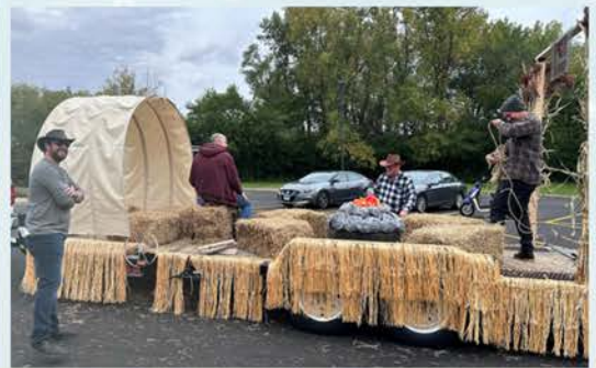
Yee-haw! Our western-themed float was a huge hit at this year's Settlers Day Parade.