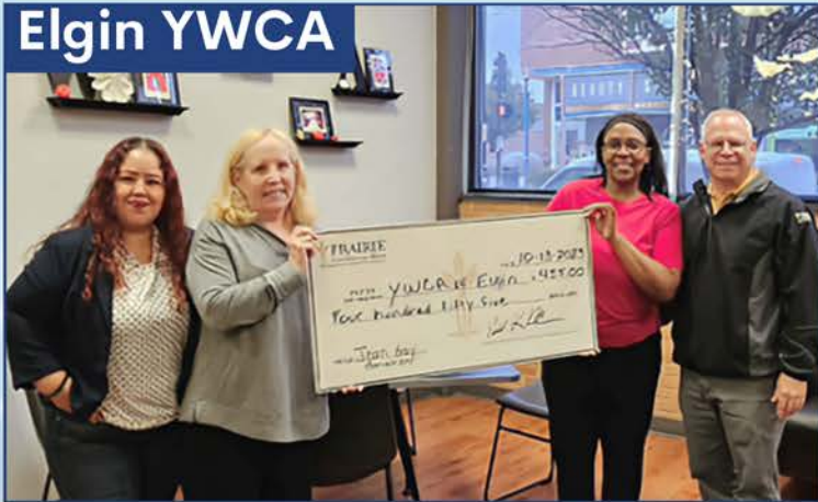
Prairie raised funds in September to donate to the Elgin chapter of the YWCA. This nonprofit is dedicated to eliminating racism while empowering women and promoting peace, justice, freedom and dignity for all.