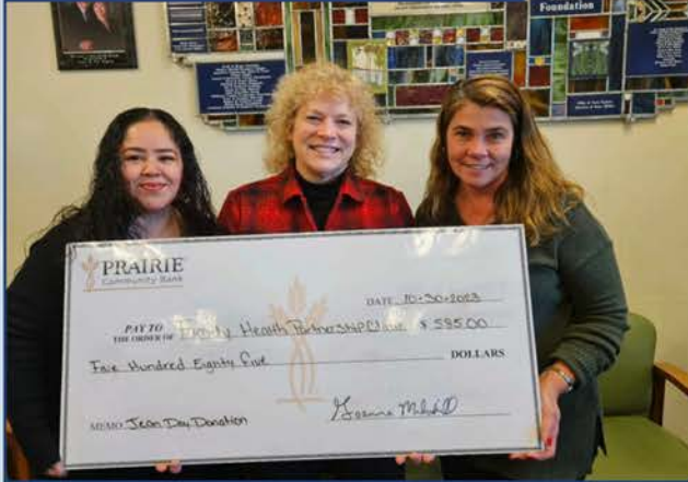
In October, Prairie employees raised funds to donate to The Family Health Partnership Clinic, which serves uninsured residents in McHenry County.