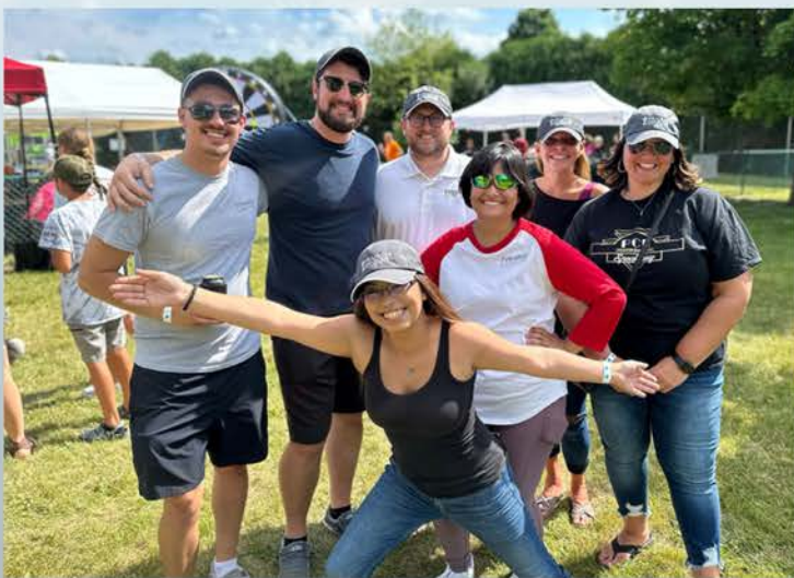
Great company and beautiful weather made for a memorable Day at the Park.